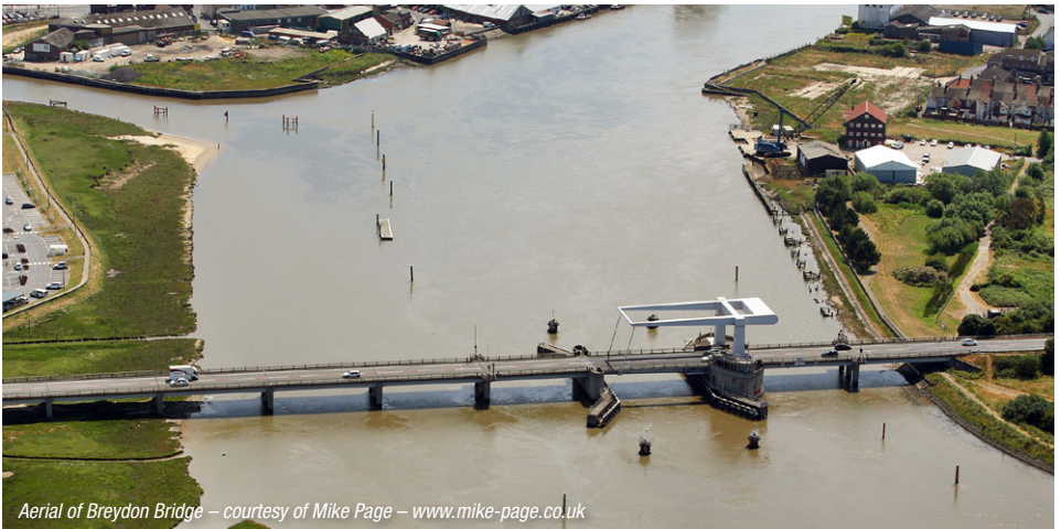
Aerial of Breydon Bridge

If you need advice on tides, or crossing Breydon on a particular day, contact Broads Control on 01603 756056, and in general see the BA Waterways Code leaflet Crossing Breydon Water . Alternatively, contact the yacht station at Great Yarmouth on 01493 842794 or 07766 398238. The Broads Authority staff at the yacht station are very knowledgeable and helpful.