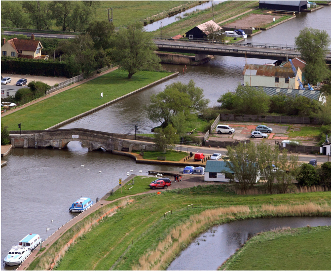
Potter Heigham bridges