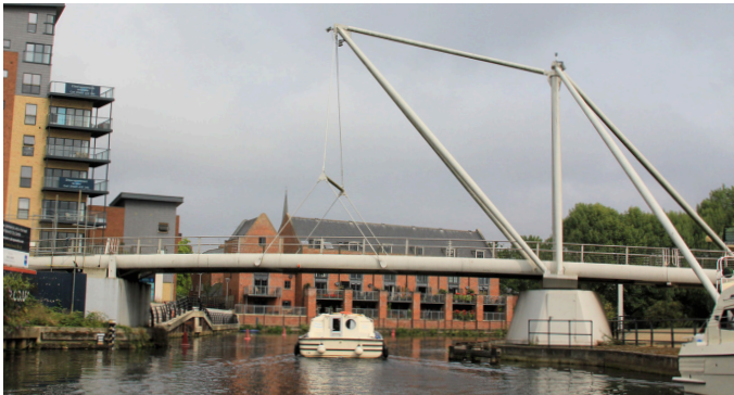
Lady Julian bridge

24 hours' notice is required for the opening of these bridges.