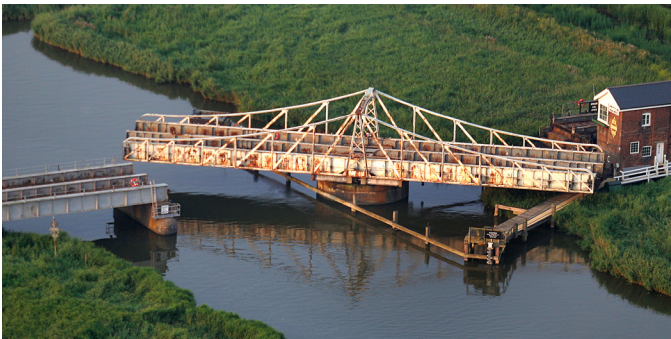
Somerleyton swing bridge