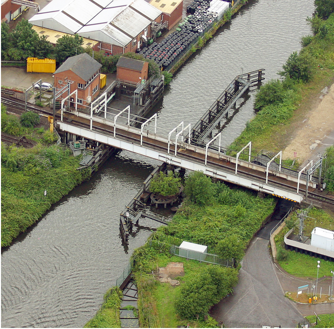
Trowse swing bridge