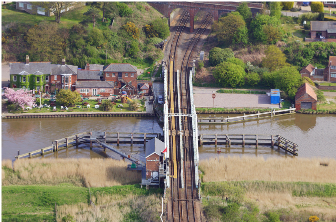
Reedham swing bridge