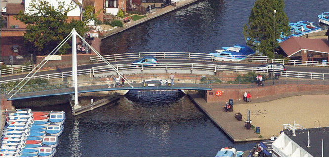
Wroxham road bridge