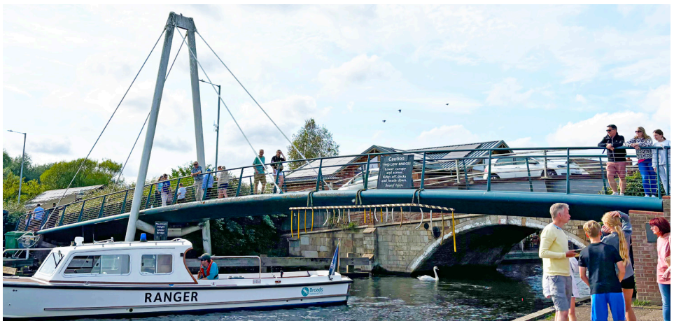
Wroxham road bridge

Two of the lowest bridges, at Potter Heigham and Wroxham, are arched, and the heights given are the highest point only, at the centre of the arch. Boats with wide cabin roofs may require more height than is available at the full width of the boat cabin, in which case the bridge pilot should be used.