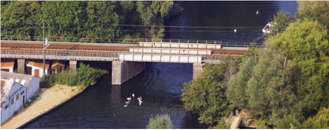
Wroxham rail bridge

Pilot assistance is available from Granary Staithe (next to the bridge, downstream) if required.