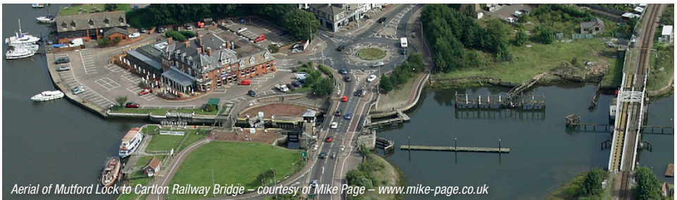
Aerial of Mutford Lock to Carlton Railway Bridge