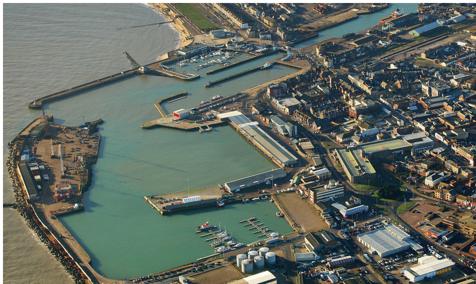
Aerial of Lowestoft Harbour

An additional lifting bridge, inland from the Lowestoft Harbour Bridge has an airdraft of 12m. It is known as the 'Gull Wing Bridge' due to its configuration. For navigational details about the bridge and its opening times, contact Lowestoft Harbour Control (above).