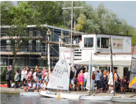
Horning Sailing Club, host of the 2024 Broadland Youth Regatta