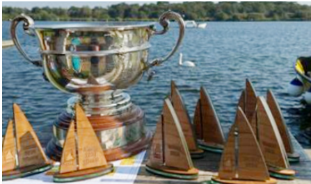
Broads Area Inter-Club Championship Ramuz Trophy and prizes

The basis of competition was to form two leagues, upper & lower, using 6 and 5 Firefly Dinghies, without discard and counting all results; following an initial random allocation (slightly seeded), teams moved up or down with repêchage so that at the end of four rounds a Demi-Final and Final could determine winners. Expectations proved difficult with some new helms but from established previous top-performing clubs, some well-known helms but would they perform in the small Fireflies (?), and some with Firefly experience but little elite-echelon history.