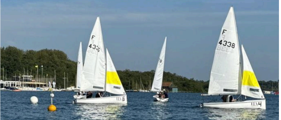
Start, during the 2024 RAMUZ Trophy event held at Norfolk Broads Yacht Club