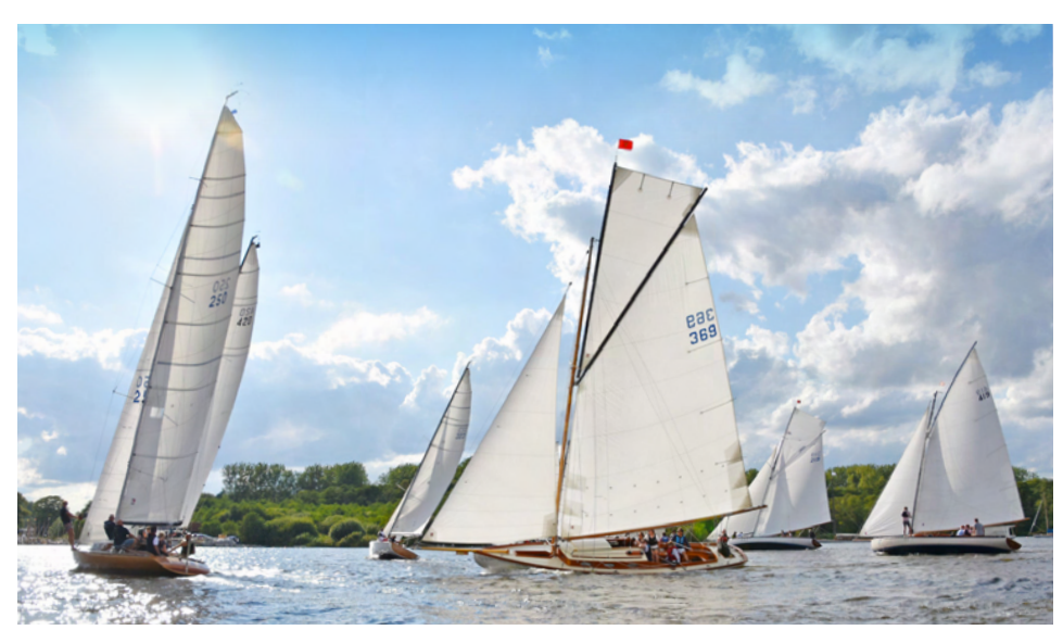
Norfolk Broads Yacht Club