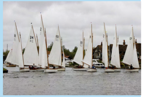
Yare & Bure One Design Start

email: the3riversrace@gmail.com web: 3RR.uk