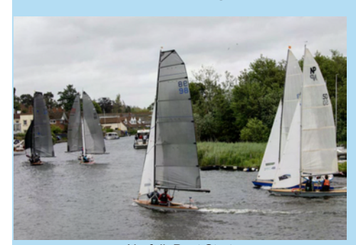
Norfolk Punt Start

Application packs from www.3RR.uk Closing date for entries 20<sup>th</sup> April 2025