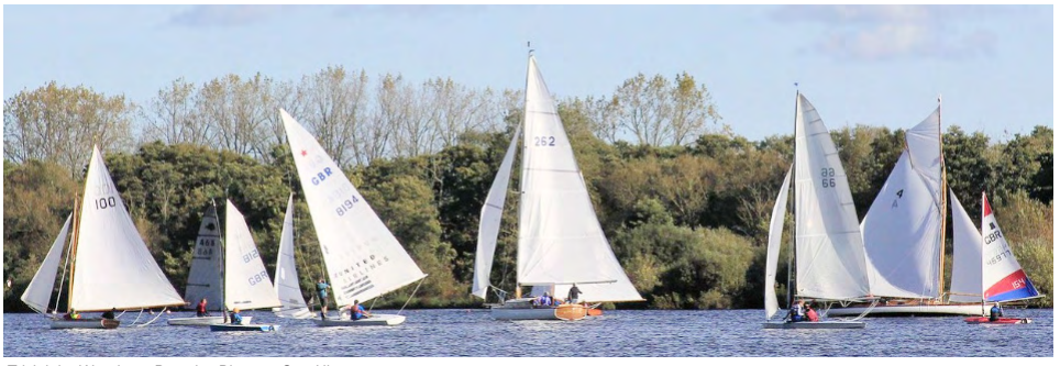
Tri-Icicle, Wroxham Broad