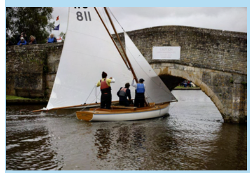
Shooting Potter Heigham Bridge