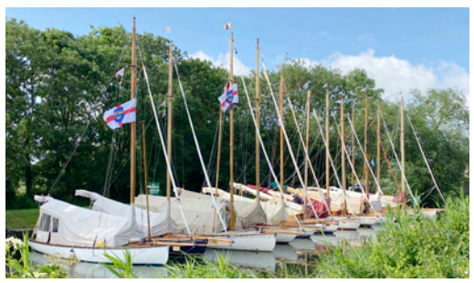
Please check club website for up-to-date information prior to each event: www.ea-cc.org