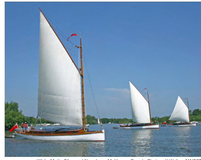
White Moth, Olive and Norada on Malthouse Broad

More information can be found at www.wherryyachtcharter.org