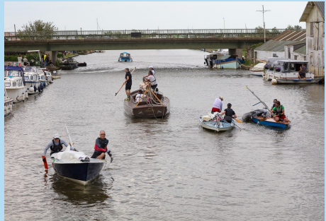
Potter Heigham - Between the Bridges