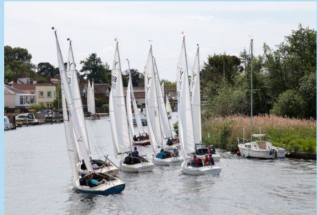
The Yeoman Start