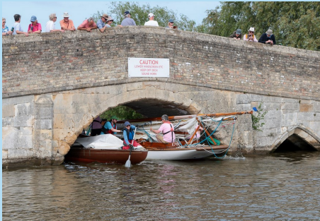
Potter Heigham - The Old Bridge