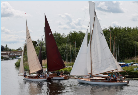
A Cruiser Start

Application packs from www.3RR.uk Closing date for entries 19 th April 2026